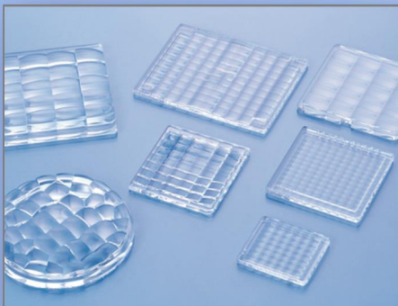
Molded lens arrays

Glass Melting, Molding, Polishing, Coating, R&D, Quality Control, Optical Design.