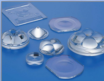
Free Form optics