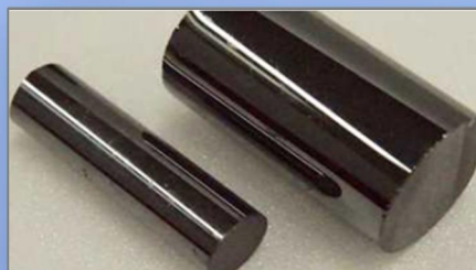
IR transmissive moldable Glass (Chalcogenide Glass)